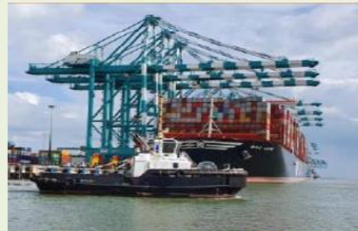
Green Marine Tug & Pilot Boats